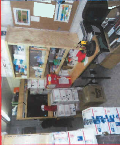
The Task Force Lobos' Unit Ministry Team office is now a place where needs have a ready supply. We are "OPEN FOR BUSINESS."