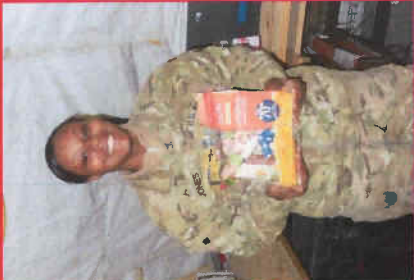
Care packages and gifts went from boxes to blessing almost immediately. One package became Platoon Holiday treats, another provided warmth and a third became a nice treat at the end of a long day (NO POPPING REQUIRED).