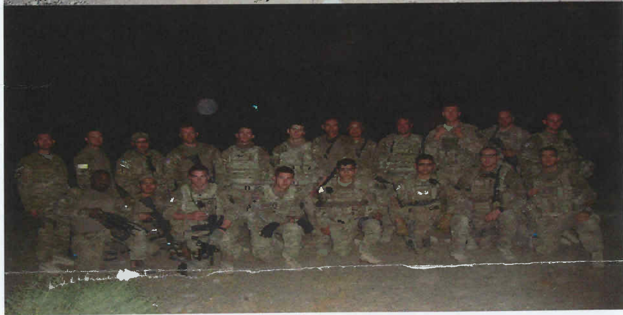
Soldiers from 504 th BFSB and our Afghan partners.